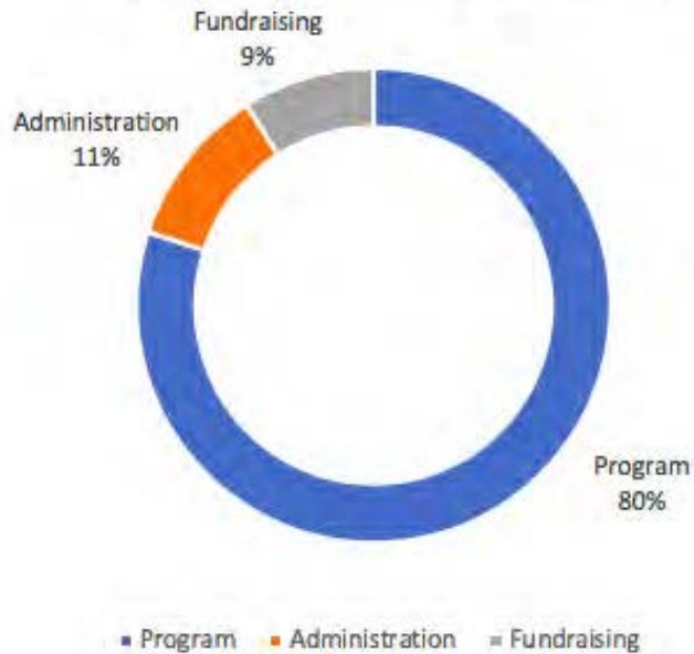
Average % Total Spent by Charities