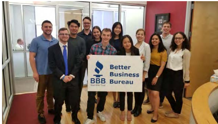
Summer 2019 interns in the Manhattan BBB office.