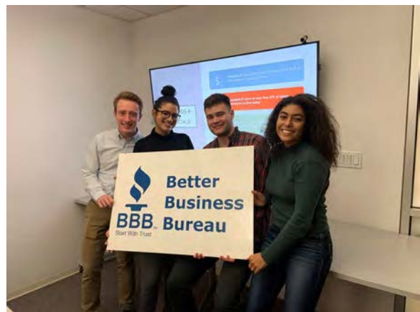
2019 Charity Program interns present a mock Standards briefing to wrap up their semester