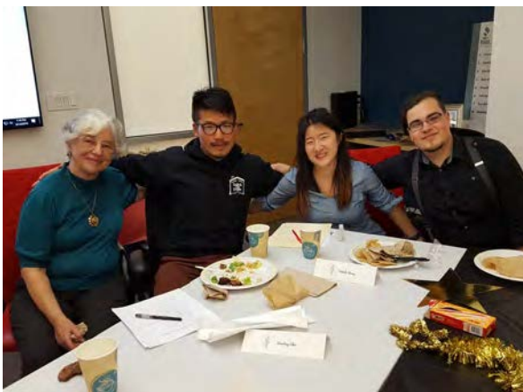
2019 interns and volunteers are recognized during National Volunteer Week