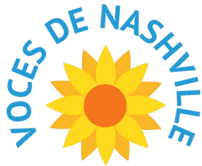
Search for the Community Second Place Winner Voces De Nashville LLC