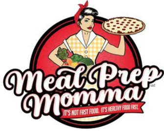
First Place Winner Meal Prep Momma