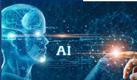
AI Best Practices for Businesses